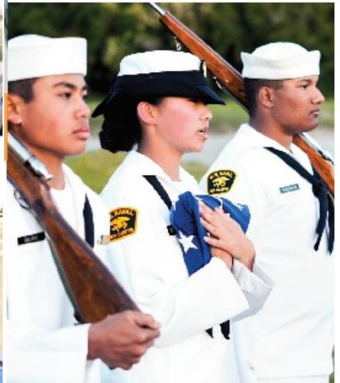
CHART YOUR COURSE